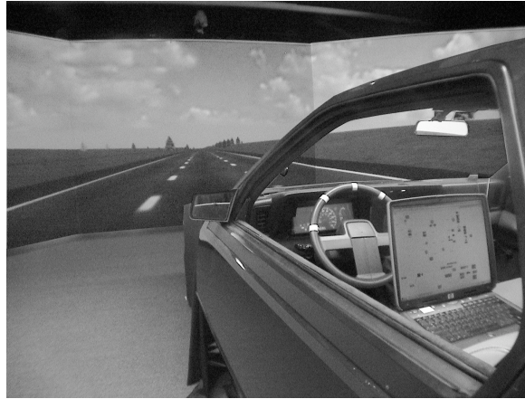
Figure 3. QN-MHP steering the driving simulator.